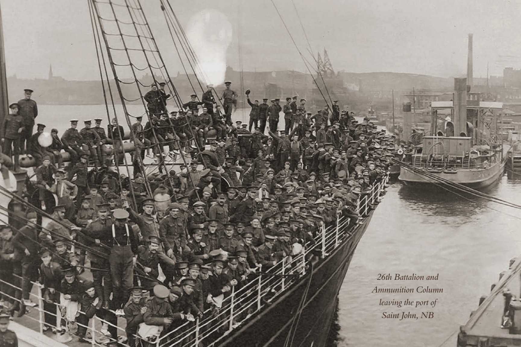
26th Battalion and Ammunition Column leaving the port of Saint John, NB