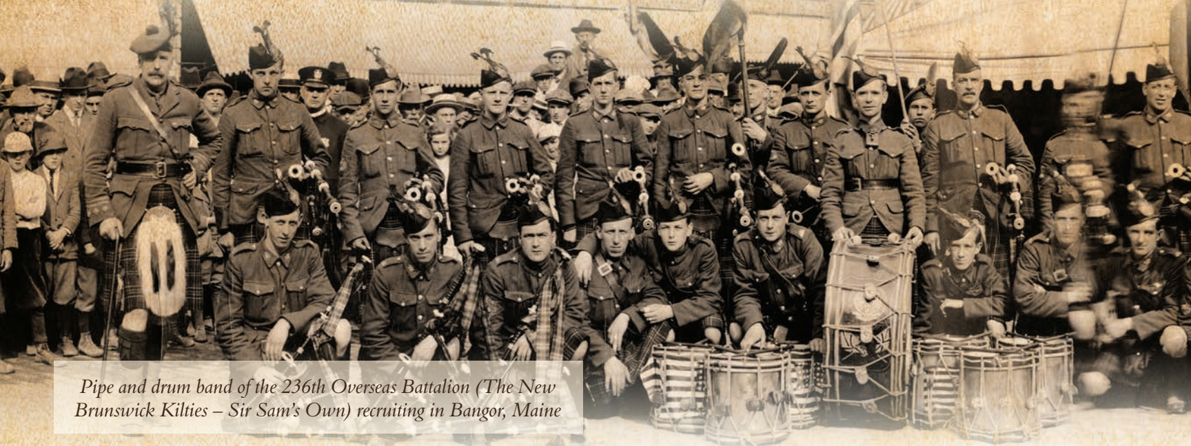
Pipe and drum band of the 236th Overseas Battalion (The New Brunswick Kilties – Sir Sam's Own) recruiting in Bangor, Maine

When combined with the growing list of casualties, the sense of success felt in the closing days of the war was mixed with a sense of uncertainty and widespread grief.