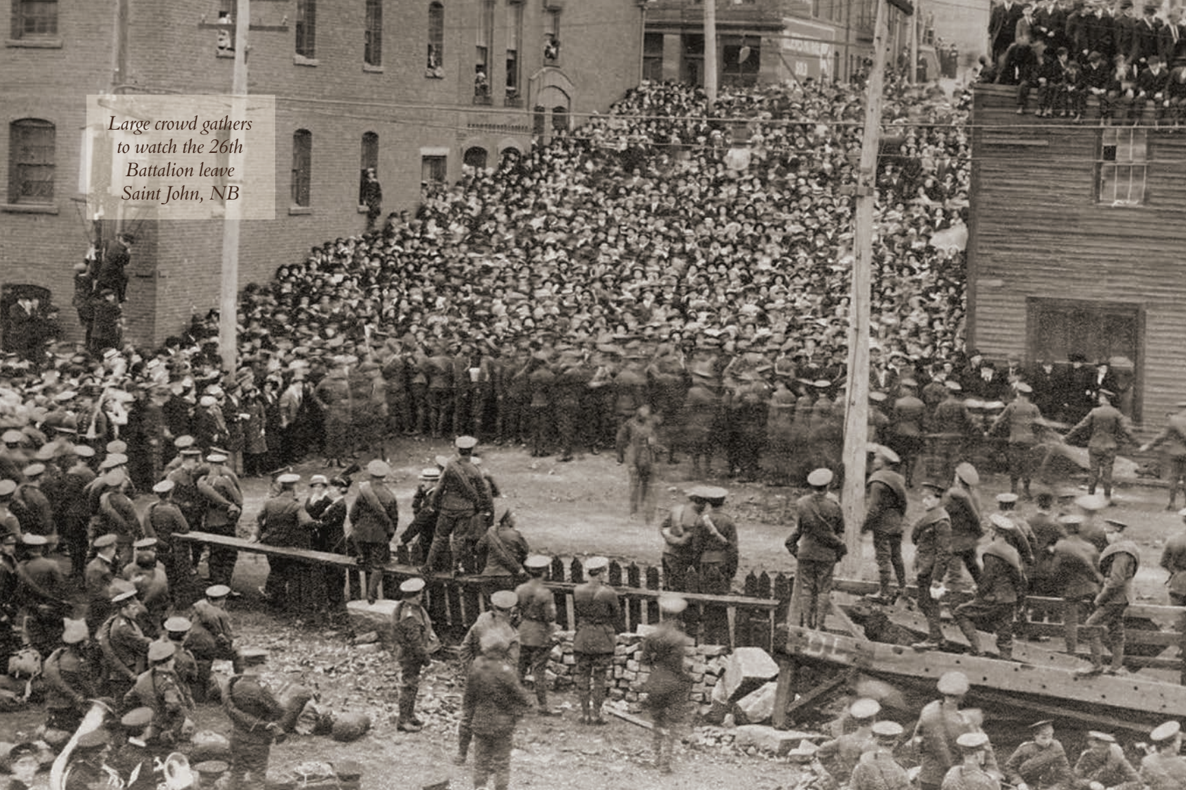
Large crowd gathers to watch the 26th Battalion leave Saint John, NB