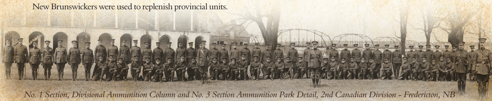
No. 1 Section, Divisional Ammunition Column and No. 3 Section Ammunition Park Detail, 2nd Canadian Division - Fredericton, NB

The return of wounded soldiers made the realities of war even more tangible. Their needs inspired the formation of civilian organizations to welcome these soldiers home. As well, a convalescent hospital was eventually set up in Fredericton, NB to help soldiers recover from their wounds and prepare for re-integration into civilian society. For many of the wounded, this required months of rehabilitation.